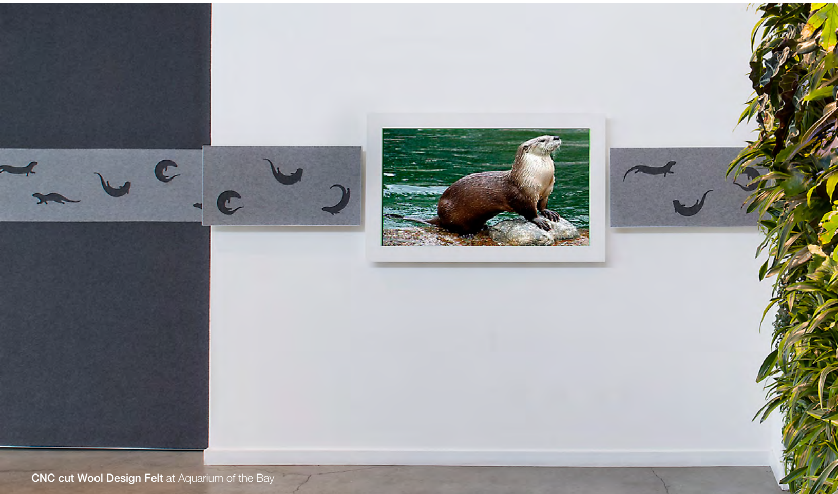
CNC cut Wool Design Felt at Aquarium of the Bay