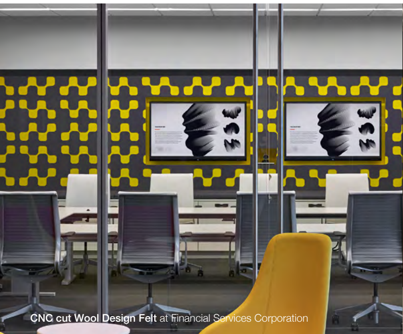
CNC cut Wool Design Felt at Financial Services Corporation