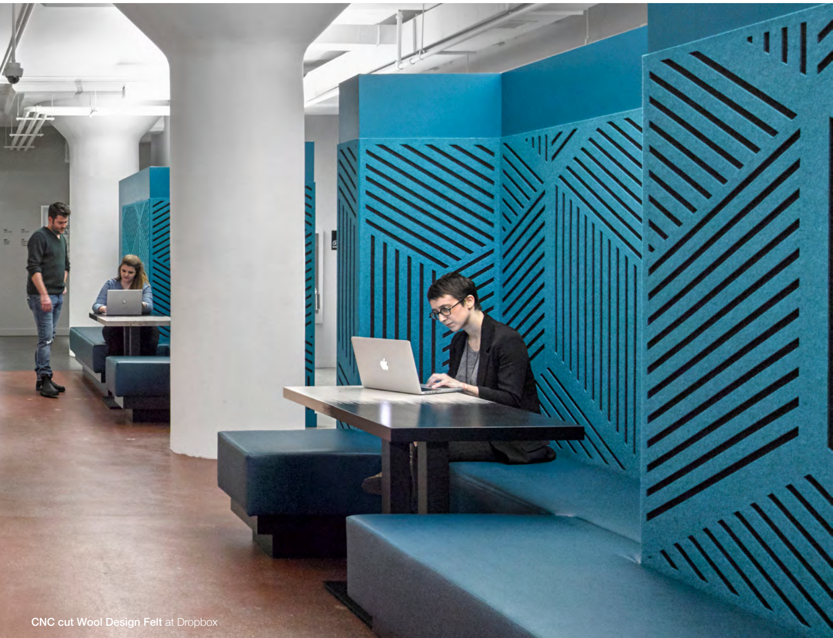
CNC cut Wool Design Felt at Dropbox