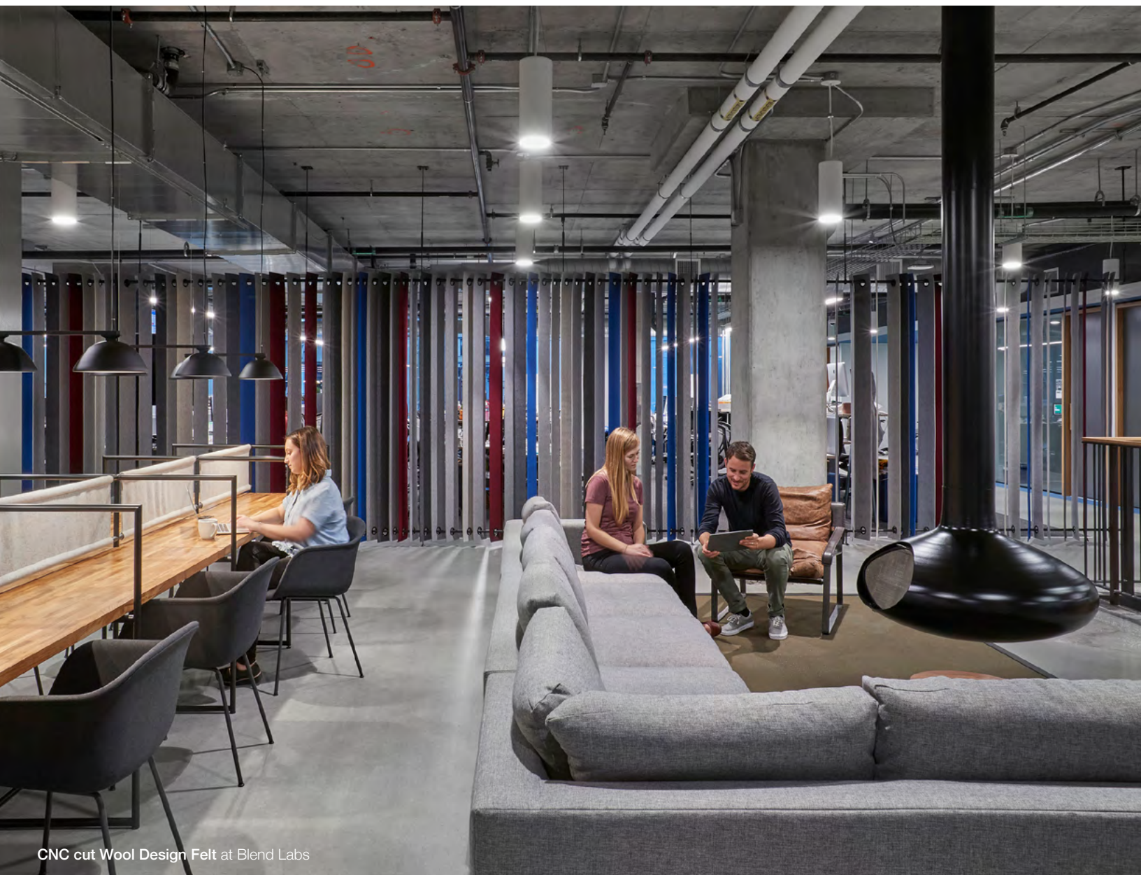
CNC cut Wool Design Felt at Blend Labs