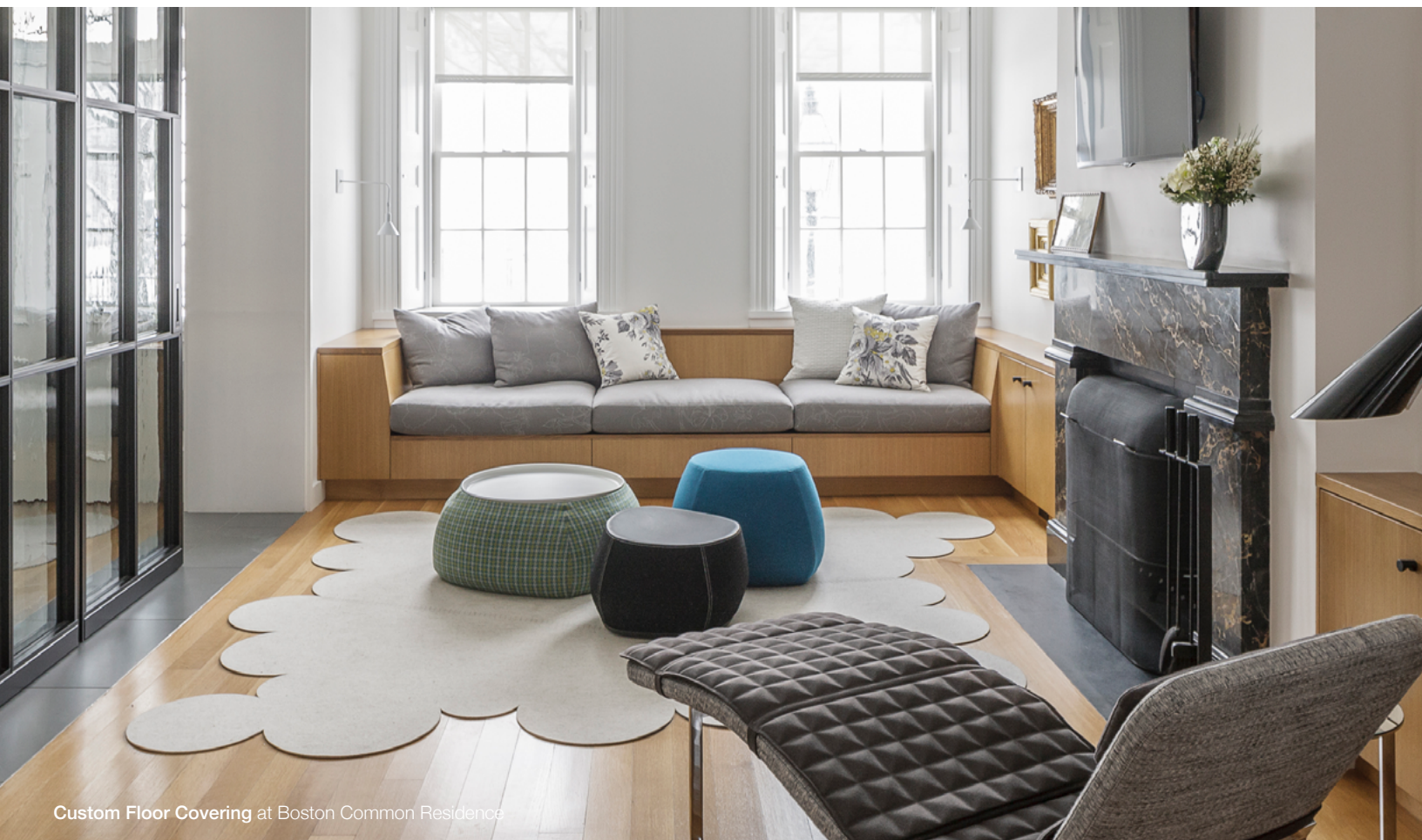
Custom Floor Covering at Boston Common Residence