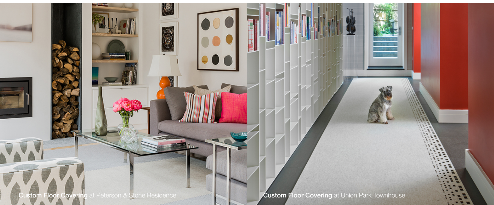
Custom Floor Covering at Peterson & Stone Residence